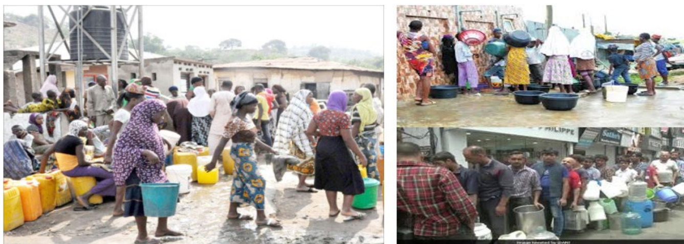
Figure 1. Situations of water searching/sharing in some locations in developing nations